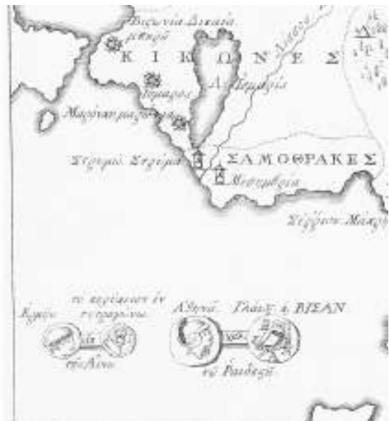
Version-A, sheet No. 9: the letters “ΑΙ” are missing. Here, in sheet No. 6 it is written only the part “ΓΑΙΟΝ”!