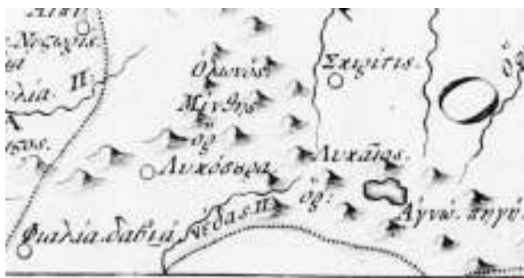
Version-B , sheet No. 5: toponym “νέδας. Π.”. The river above the toponym is traced differently.