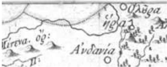
Version-B , sheet No. 2: toponym “ἦρα” with a mountain symbol below. The river is traced differently.