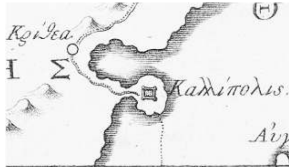
Version-A, sheet No. 8: letter missing.