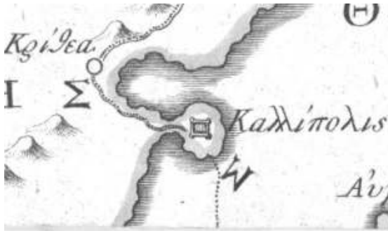
Version-B, sheet No. 8: letter “Σ”.