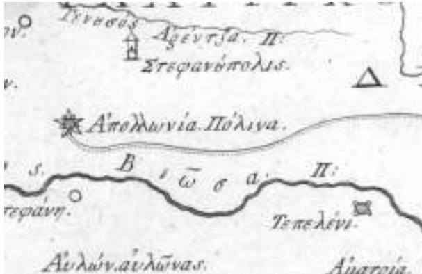
Version-B, sheet No. 7: road symbol below "Απολλωνία Πόλις".