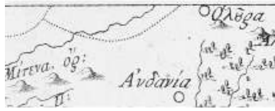
Version-A , sheet No. 2: toponym and mountain symbol missing. The river is traced differently.