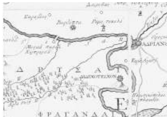
Version-B, sheet No. 9: toponym missing.