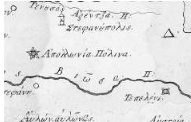
Version-A, sheet No. 7: road symbol missing.