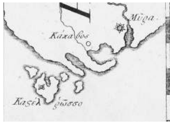
Version-A , sheet No. 3: text missing.