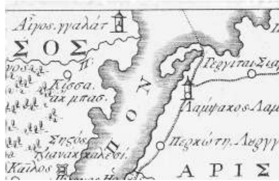
Version-A, sheet No. 6: toponym "ΠΙΟΝ" ("ΤΟ" is missing).