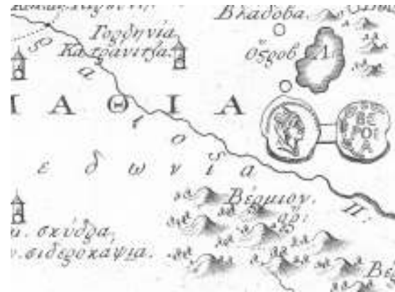
Version-A, sheet No. 8: toponym missing.