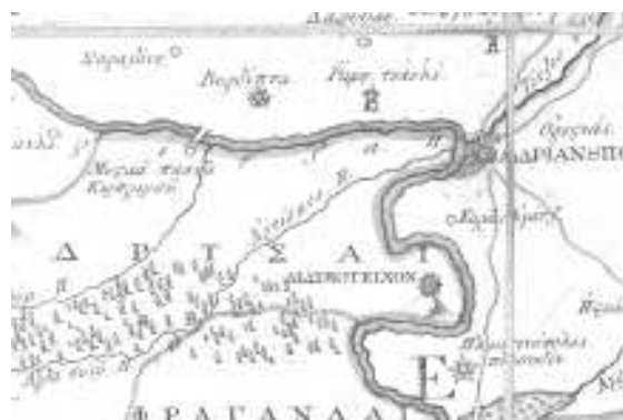
Version-B, sheet No. 9: toponym “Αρτίσκος Π.”.