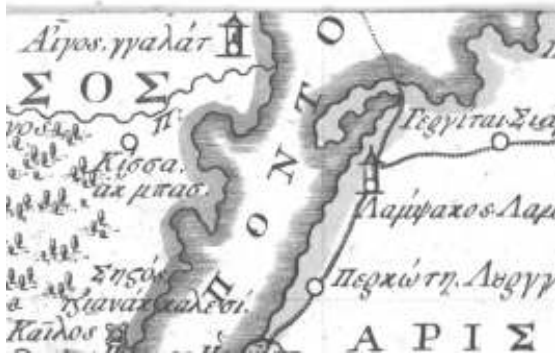
Version-B, sheet No. 6: toponym "ΠΙΟΝΤΟ".