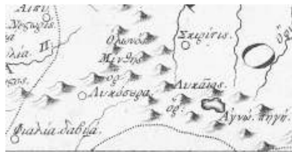
Version-A , sheet No. 5: toponym missing. The river above the toponym is traced differently.