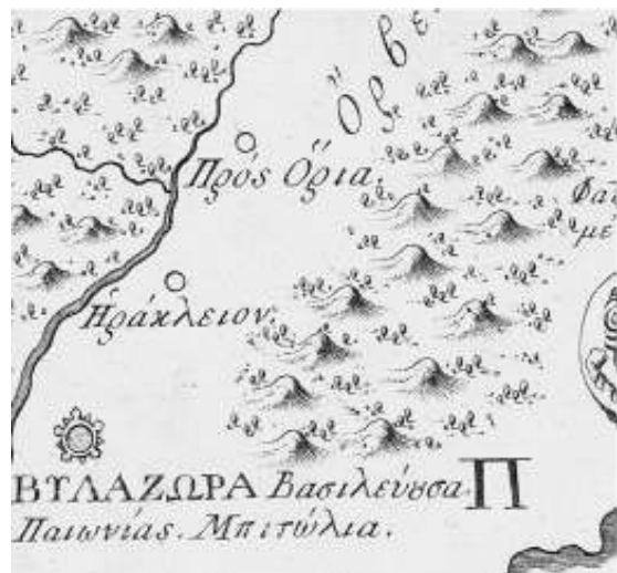
Version-A, sheet No. 8: toponym missing.