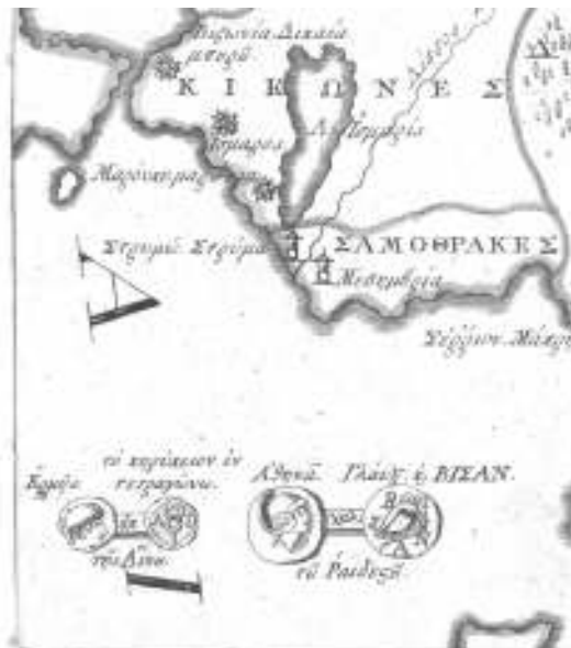
Version-B, sheet No. 9: the letters “ΑΙ” of toponym “ΑΙ-ΓΑΙΟΝ” (the rest part “ΓΑΙΟΝ” is in sheet No. 6).