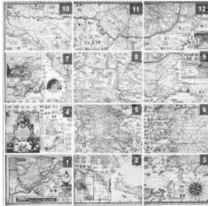
Figure 1: Rigas Charta . The 12 numbered map-sheets.