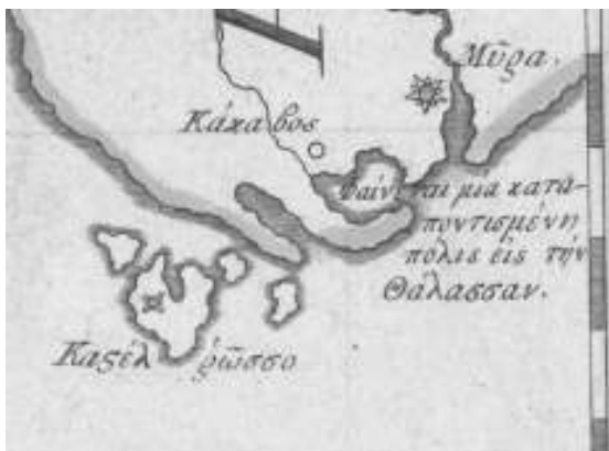
Version-B , sheet No. 3: text “Φαίνεται μία καταποντισμένη πόλις εἰς τὴν Θάλασσαν.”