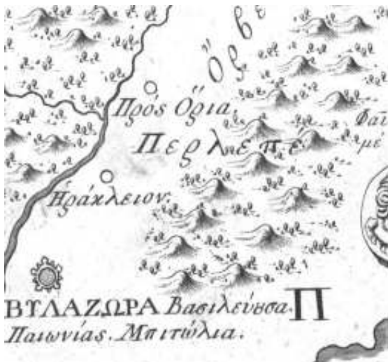
Version-B, sheet No. 8: toponym "Περλεπέ".