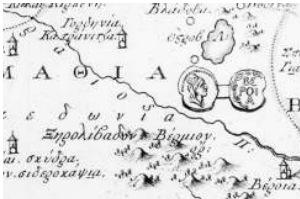
Version-B, sheet No. 8: toponym “Ἐηρολίβαδον”.